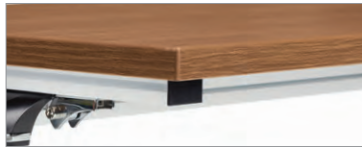
Table tops available in a large variety of laminate finishes (Walnut Heights shown)