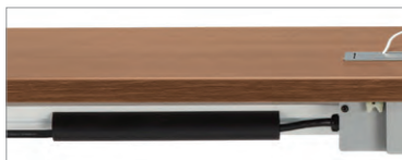
Optional wire management snap-in channel