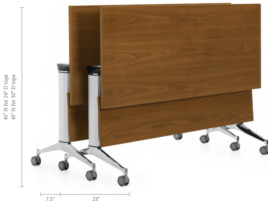
Optional modesty panel articulates with table top in upright position.