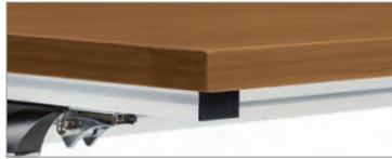
Table tops available in a large variety of veneer finishes (Latte Walnut shown)