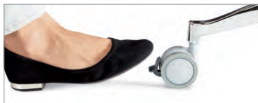
Locking dual wheel casters swivel 360°