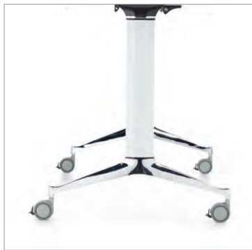
Leg column and cross beam available in a full range of finishes (Designer White shown). Foot is standard in Polished Aluminum