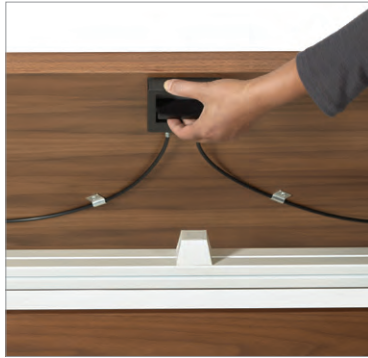
One handed flip up operation