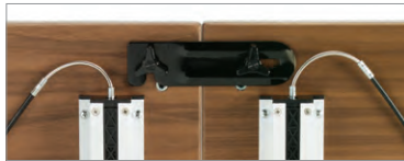
Optional ganging plates