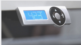
Optional: Joggle handset with digital backlit display