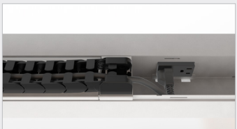
Eight wire power trough with energy chain