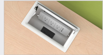
Cable tray with access door open showing power and USB module.