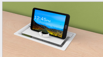
Optional lid mount device holder