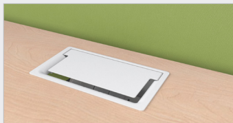
Cable tray with access door closed