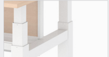
Extended height ranges from 22.57" to 48.75". Standard height ranges from 27" to 45".

© 2018 ®. * Trademark of Global Limited Partnership. Designed and Developed by Global Contract Inc. This product is covered by one or more issued patents or pending patent applications in Canada, the U.S. and elsewhere, including 2000-3328 and 2000-3214.