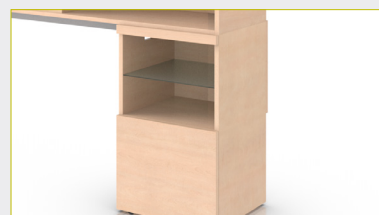
Adjustable glass shelves on both sides