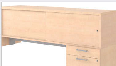
Sliding laminate door