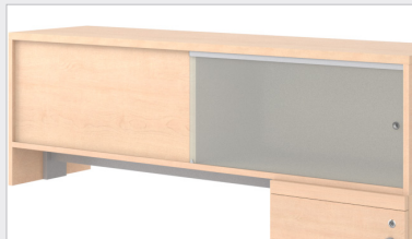
Sliding glass door