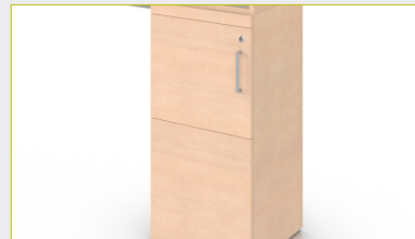
Hinged lockable door on both sides