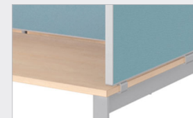
Frame and connecting hardware available in nine standard metal paint finishes.

© 2018.™ Trademark of Global Limited Partnership. Designed and Developed by Global Contract Inc. This product is covered by one or more issued patents or pending patent applications in Canada, the U.S. and elsewhere, including 2,009,312,8 and 2,009,321,4.