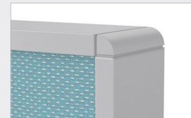
Corner features a 1/4" radius