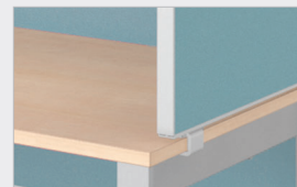
Back-to-back end of run divider