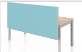
Table mounted divider