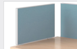
Single end of run divider