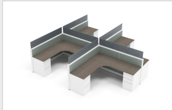
Option 2 • $888.00 EVFDK1236P • x12