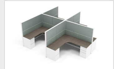
Option 3 • $2806.00 EVPCEPS424 • x1 EVPCEPSA324 • x1 EVPEERSA24 • x5 EVPFE2436 • x12 EVPIECS24 • x6

© 2020 ®, ™ Trademark of Global Limited Partnership. Designed and Developed by Global Contract Inc. This product is covered by one or more issued patents or pending patent applications in Canada, the U.S. and elsewhere, including 2000-3228 and 2000-3214.