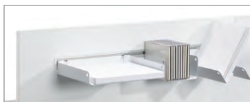
Accessory rail on laminate screens